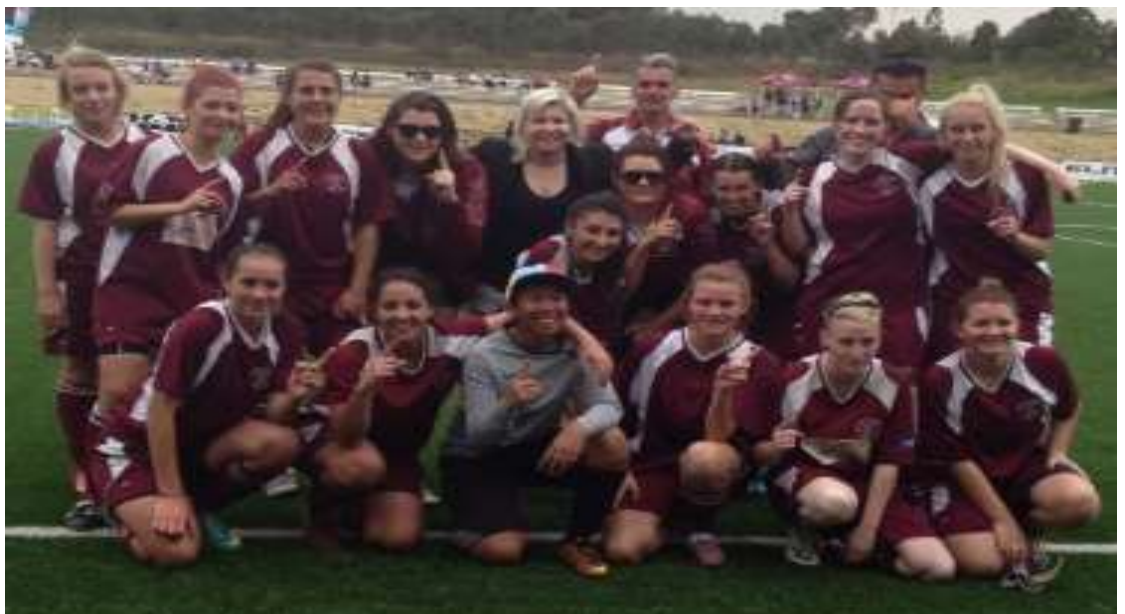
Our Women's Premier League Reserves celebrating their Grand Final Victory