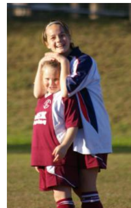
Doony v Doony in the U12 Girls Gala Day

Great Day and the girls showed great club spirit when playing each other