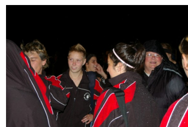
Women's Super League Team

Thanks also to the Pregs players who manned the BBQ for the evening it was a great help.